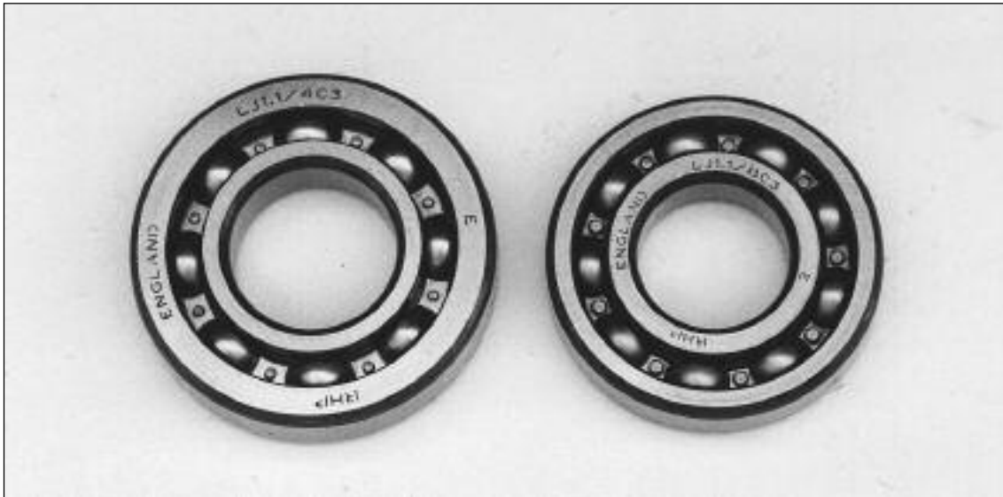
C3 Bearings left overdrive annulus front - right diff/axle output